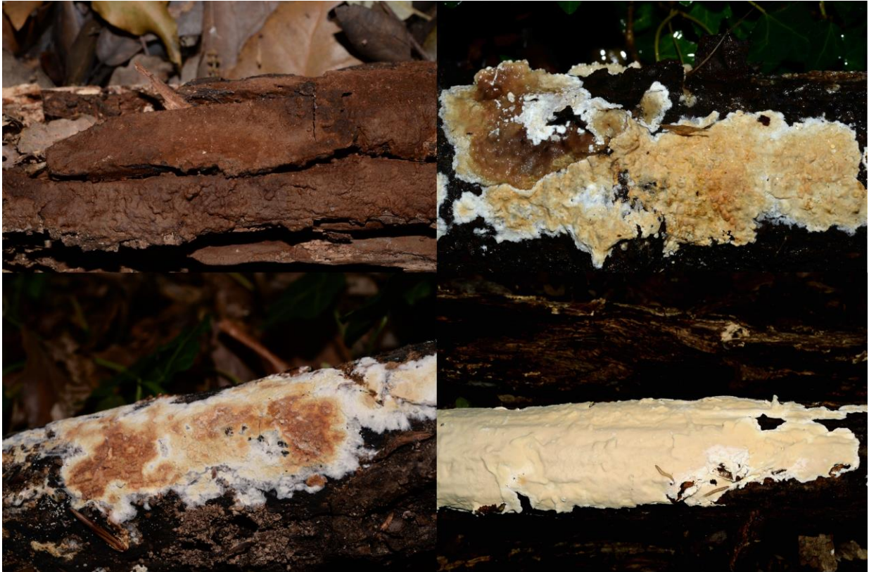
Figure 3. From top left to bottom right: Hymenochaete fuliginosa , Phanerochaete martelliana , Phlebia livida , Yuchengia narymica .