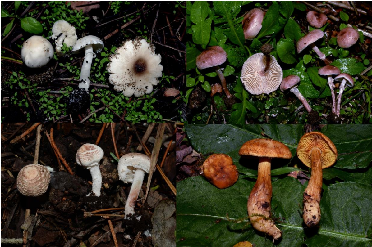
Figure 5. From top left to bottom right: Leucoagaricus menieri , Lepiota farinolens , Lepiota cystophora , Gymnopilus flavus .