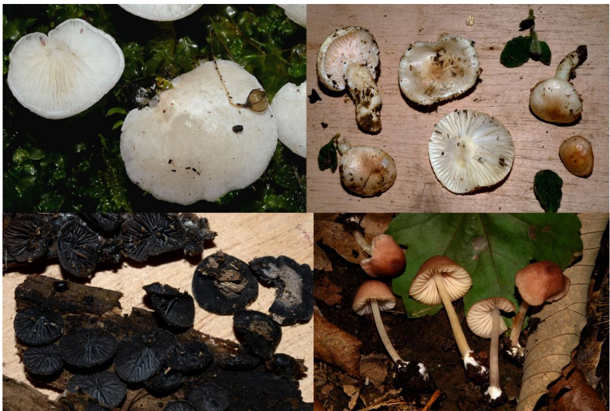
Figure 4. From top left to bottom right: Clitopilus baronii , Hygrophorus pseudodiscoideus var. cisticola , Resupinatus niger , Entoloma reinwaldii .