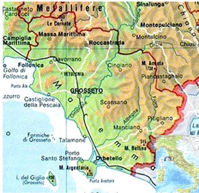
Figure 1. Map of Grosseto province.