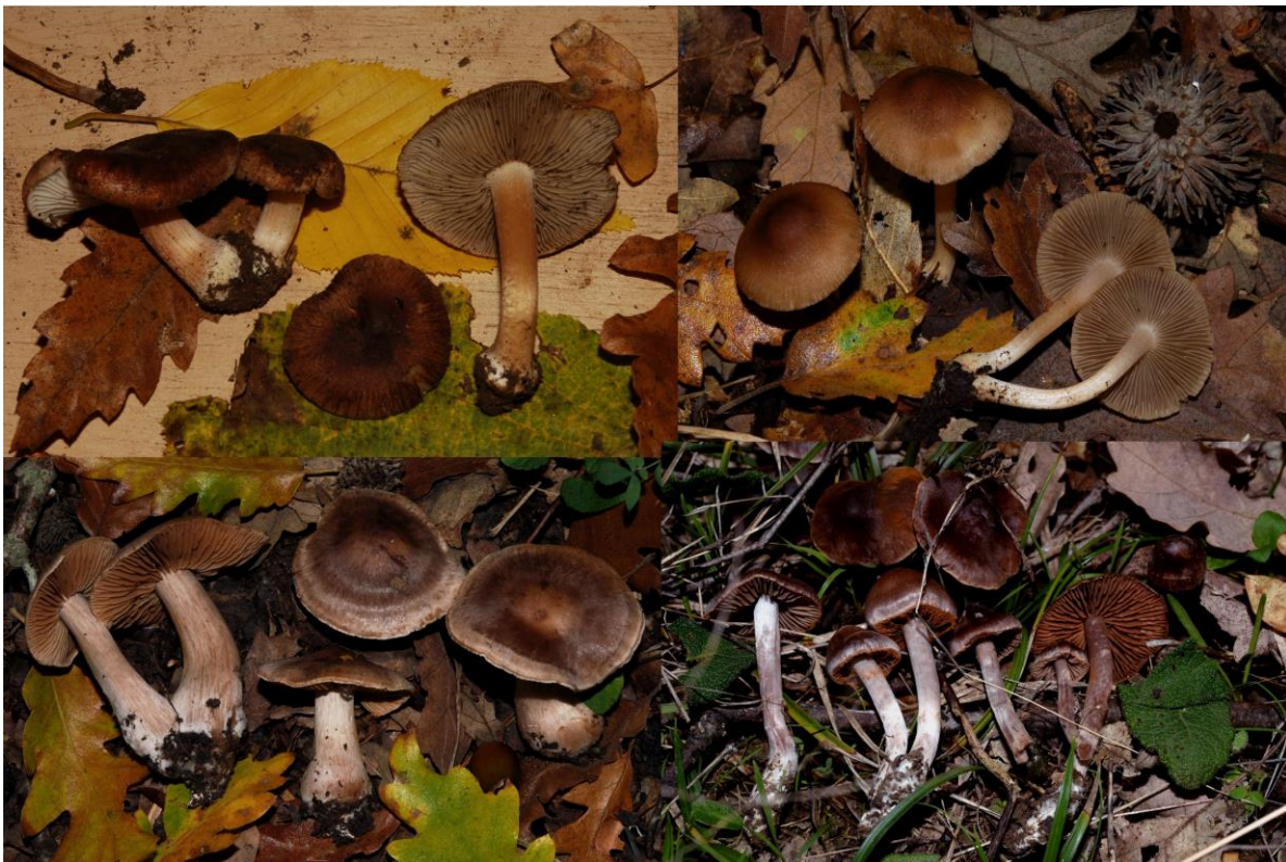
Figure 6. From top left to bottom right: Inocybe amblyspora , Inocybe suecica , Cortinarius furiosus , Cortinarius bombycinus .