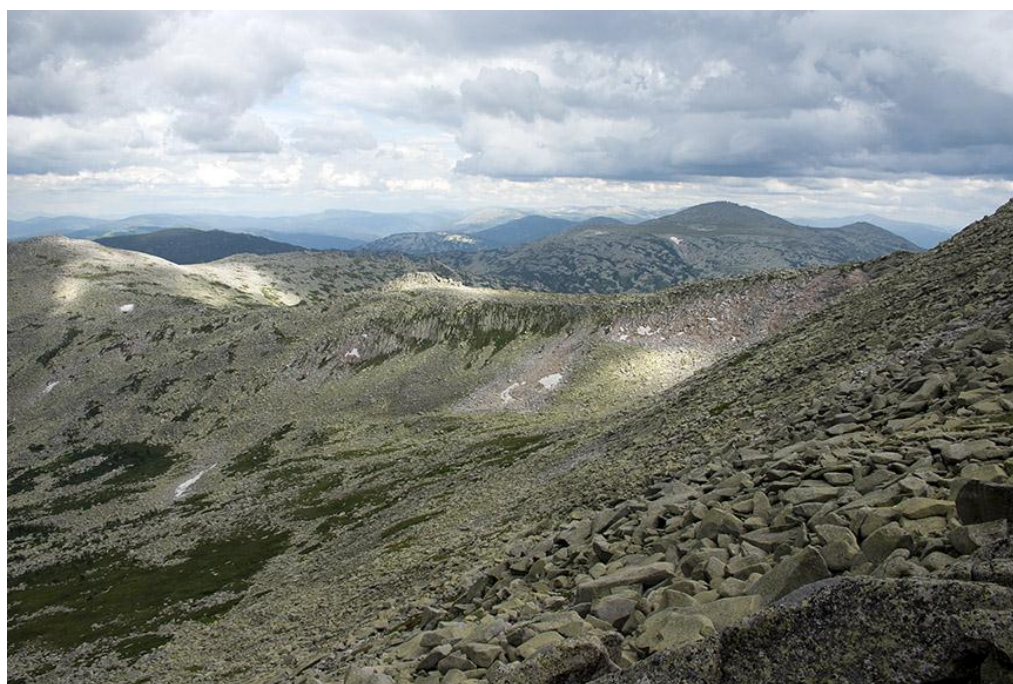
FIG. 14. Rock outcrops and stonefields with patches of alpine meadows and tundra at the high-mountain belt. Razrobotnaya Mt. (1962 m s.m.), Tigirek State Reserve, North-West Altai. The habitat of arctic-alpine species (Photo by E.A. Davydov).