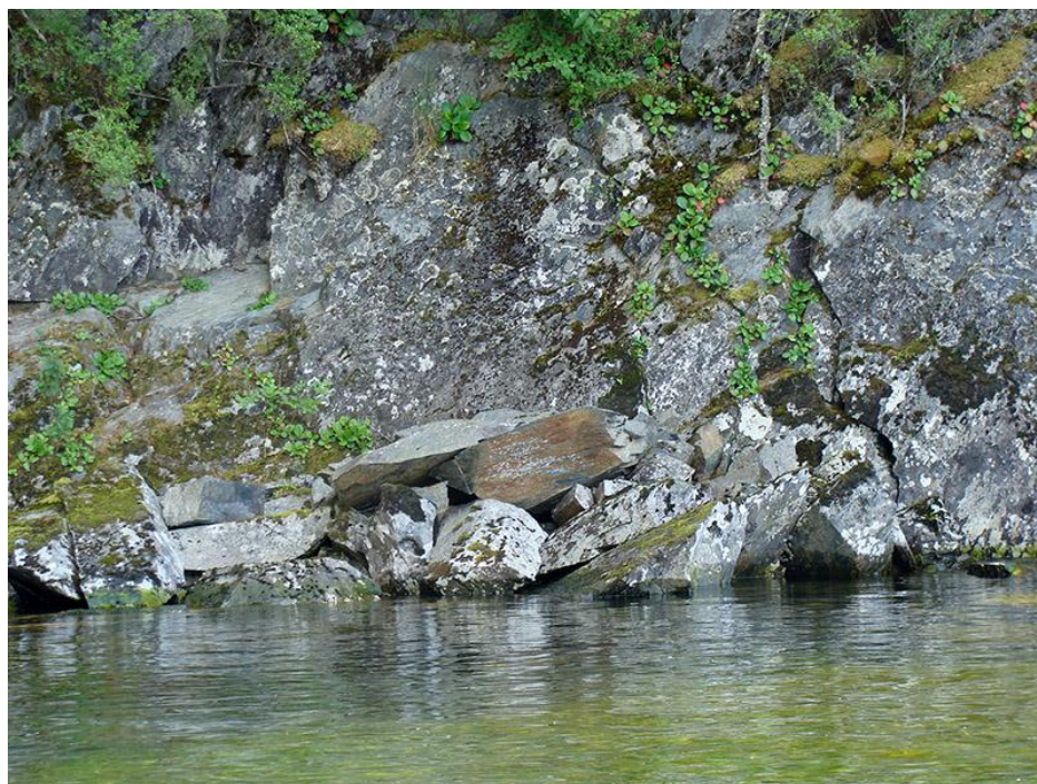
FIG. 10. Cliff near the Belaya River. Vicinity of Podpolatsy, North-West Altai