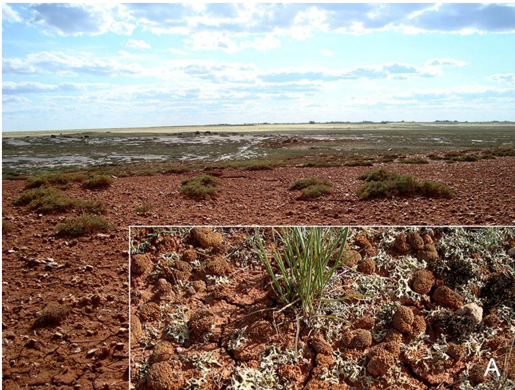
FIG. 2. Dry steppe desert-like communities on tertiary clays. Vicinity of the Tassor Lake, Kulunda. The habitat of the vagrant lichens. A: vagrant lichens Aspicilia fruticulosa , Xanthoparmelia camtschadalis , Neofuscelia ryssolea.

The lichen investigation of Altaisky krai includes two stages: the first stage, in the time period prior to the late 20 th century (ca. 1990), involved only minor data on a few lichens, usually collected incidentally during vegetation study for various botanical or geobotanical publications. The second stage, from 1990 until the present time, includes comprehensive study by botanists trained in lichenology. The very first reports, including data on only a few lichen species, were published by Georgi (1800) for the territory of Kolyvan in the Altai Mts. and by Tanphiliev (1902) for the Kulunda Plain and left-bank side of the Ob' River. Regular investigations of the Altaisky krai lichen flora started at the beginning of 1990's. A detailed history of the lichen diversity investigations was published recently (Davydov & Skachko 2014); the data are dispersed among more than forty publications. In addition, unpublished data of E. A. Davydov and E. Yu. Skachko, based on the study of herbarium material from ALTB and mostly concerning distribution of taxa, were used. The aim of the present work is summarizing all of the data in a single list using current nomenclature.