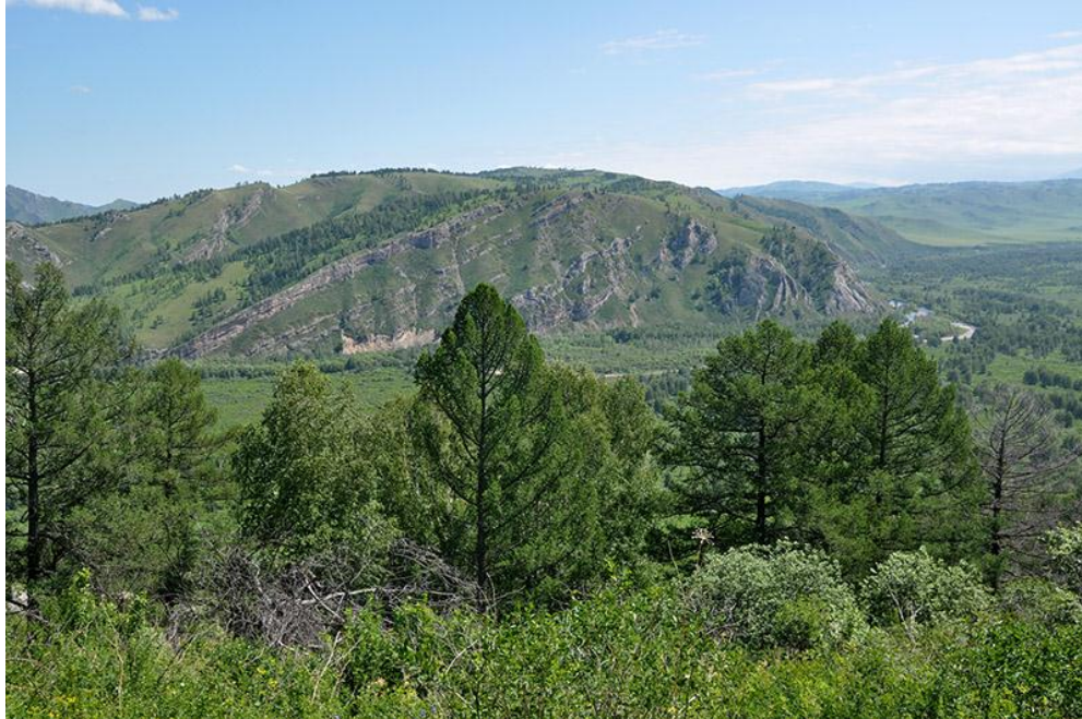
FIG. 12. Limestone outcrops. Silur open-cast “Tigrek”. The only habitat in Altai for the rare lichens Aspicilia lacteola , Placidium krylovianum , Teloschistes brevior . Tigrek State Reserve, North-West Altai.