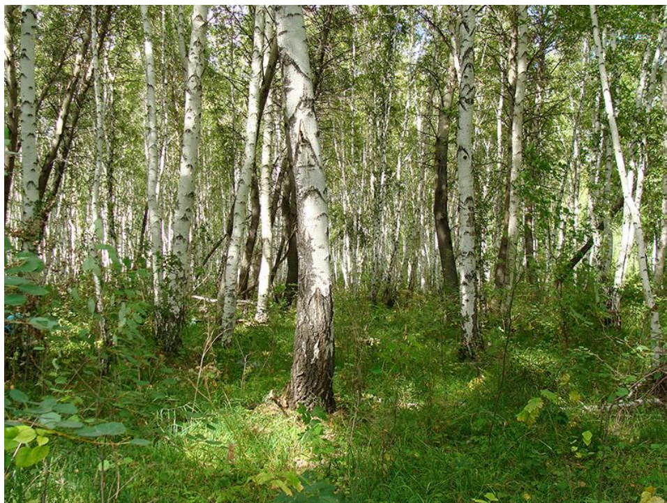
FIG. 6. Betula pendula forest at forest-steppe zone. Island-like forests within steppes and agrocommunities. Ob River Left-bank territory.