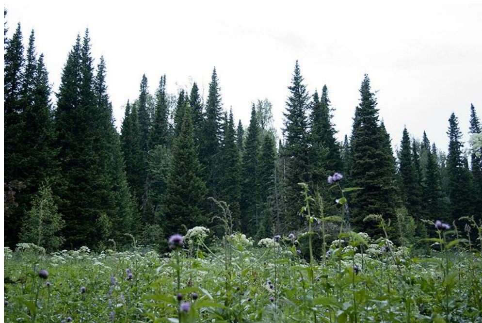
FIG. 13. Abies sibirica high-grass forest with nemoral elements. Tigirek State Reserve, North-West Altai. The habitat of the nemoral lichens with disjunctive distribution area.