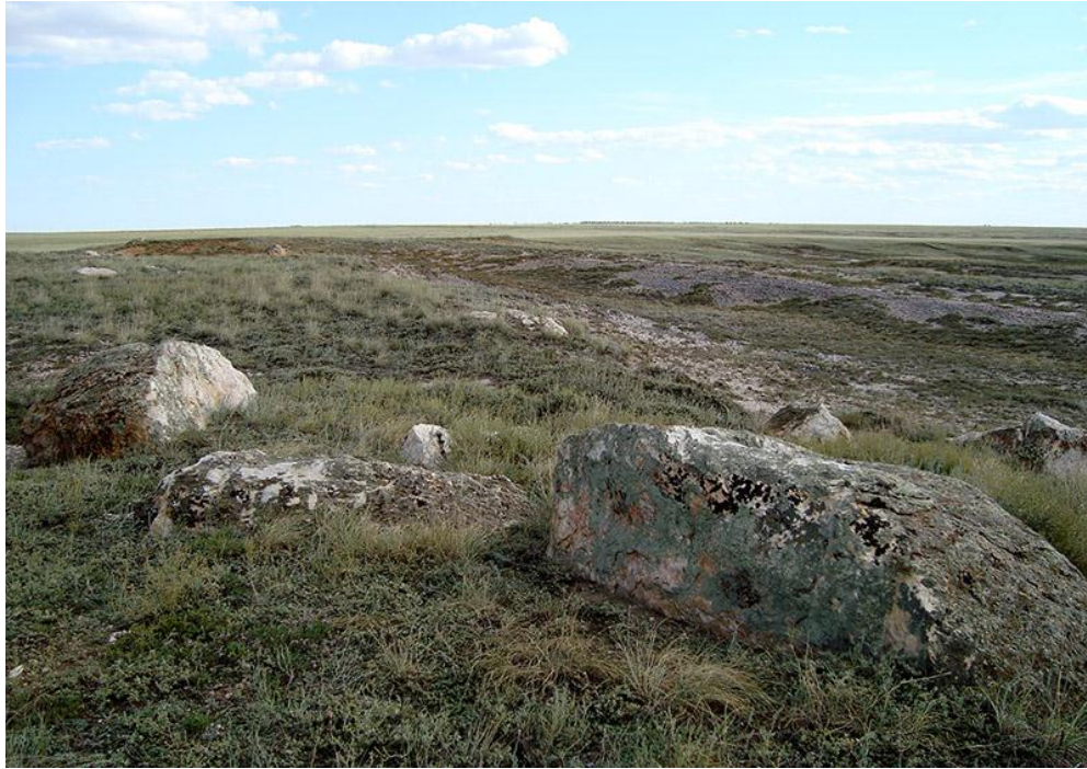
FIG. 3. Dry steppe communities with stones. Vicinity of the Tassor Lake, Kulunda. The habitat of the epilithic lichens on the plain.