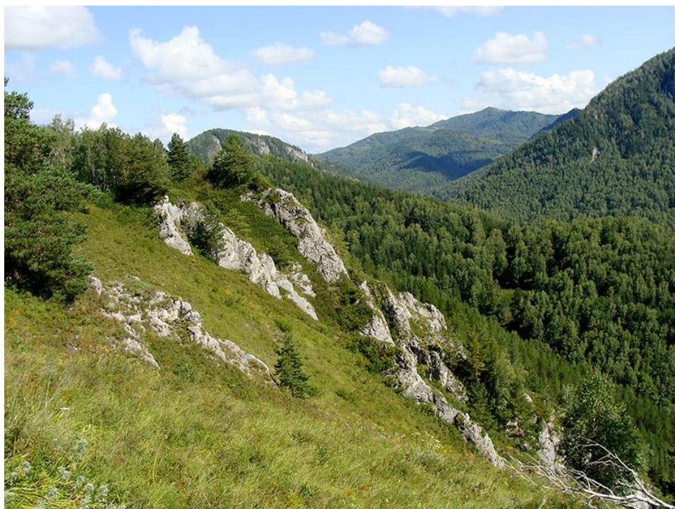
FIG. 9. Forest belt and rock outcrops in North Altai