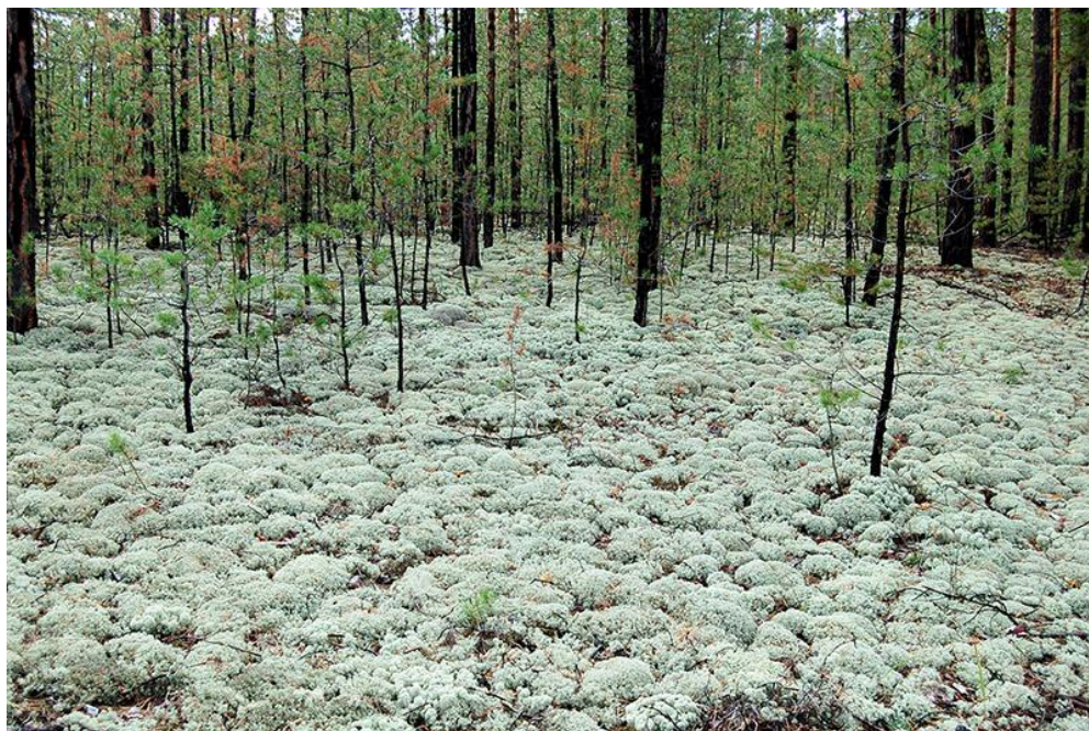
FIG. 5. Pinus sylvestris – Cladonia light forest (Pine bor). Ob River Left-bank territory.