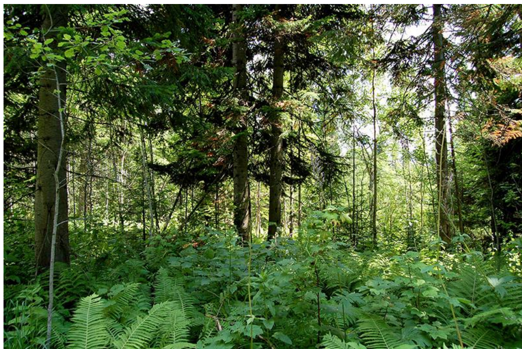
FIG. 8. Abies sibirica subnemoral forest (chern'). Salair range.