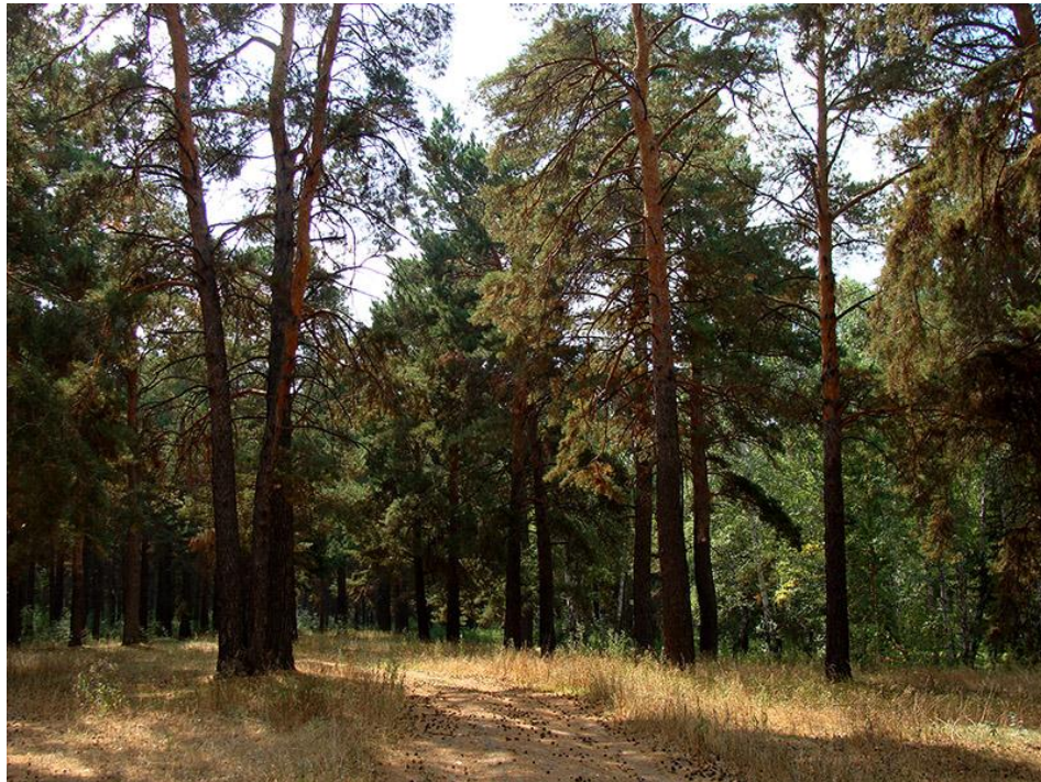
FIG. 4. Pinus sylvestris forest; island forests within the steppe zone. Vicinity of Kornilovo. Ob River Left-bank territory.