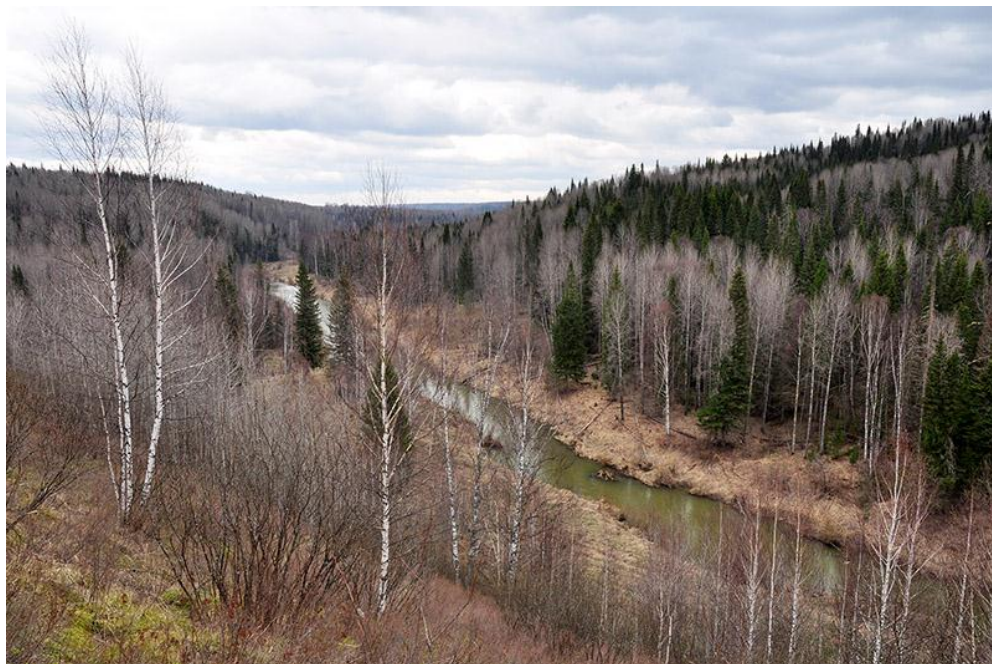
FIG. 7. Abies sibirica – Betula pendula subnemoral forest in spring. Salair range, the headwaters of the Berd' River.