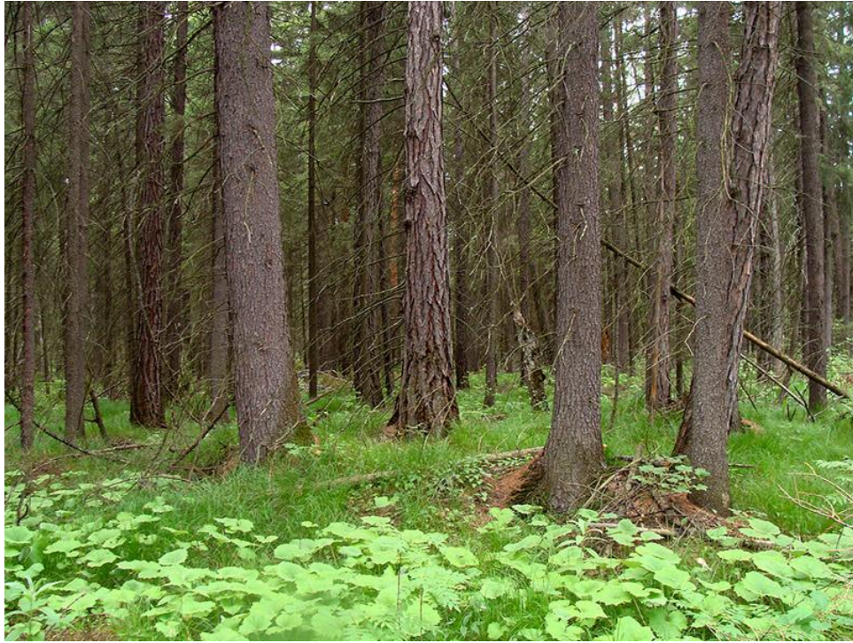
FIG. 11. Picea obovata forest within Pinus sylvestris forest massive at Ob River Right-bank territory. The habitat of boreal species in forest-steppe zone. Vicinity of the Kislukha.